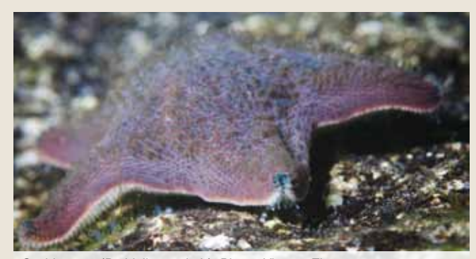
Cushion star (Patiriella regularis).

The Department of Conservation manages Te Paepae o Aotea (Volkner Rocks) Marine Reserve. To uphold the values of the marine reserve surveillance and enforcement is undertaken by DOC with the assistance of others. Failure to comply with the Marine Reserves Act, 1971 may result in prosecution.